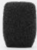
1 x WS5