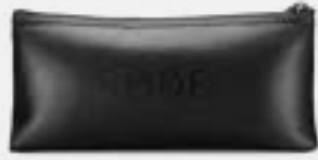
1 x ZP1